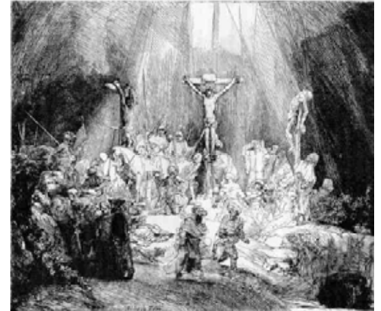
Etching by Rembrandt, The Three Crosses, first edition, 1653

Sunday evenings from March 11 Time: 7:00 - 8:00